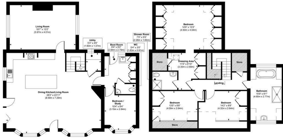
Ground Floor Approximate Floor Area 1159 sq. ft. (106.83 sq. m)